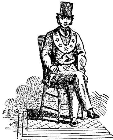
MOST WORSHIPFUL MASTER IN THE EAST

ferring of the different degrees (E. A., F. C., and M. M.); but they are masonically styled by the Craft as the Ground Floor, Middle Chamber, and Sanctum Sanctorum .